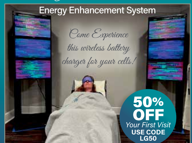
Reverse Aging & Chronic Disease • Reduce Stress, Anxiety, and Inflammation • Activate Stem Cells